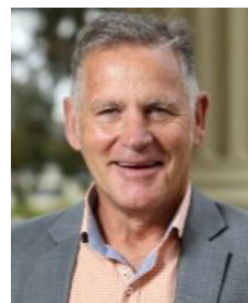
Mayor Peter Murrhiy Cancer Survivor